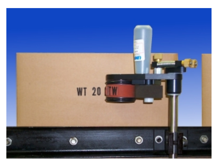
Model Shown: MC-10NI

Universal Mini-Coders are recommended for applications which require printing a small amount of code data on cartons or other flat surface materials. The unique inverted design enables the non-indexing Mini-Coder to print within \frac{1}{2} " of the conveyor belt (within 1-1/8" of the conveyor belt with indexing models). Our patented dual compression spring tension mechanism allows the unit to be installed on either side of the conveyor line without modification.