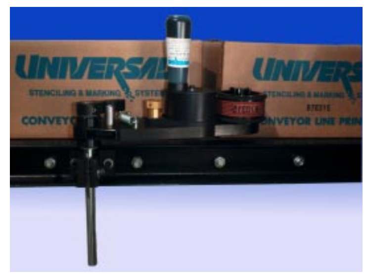
Shown with optional Reservoir Inking System Cover

Universal's line of MidSize Coders establish a new standard of quality and versatility in contact coding systems. The unique modular design of these machines provides the flexibility to adapt the coder to a wider range of applications than any other system on the market. To provide unsurpassed durability, the frames and print drums on these coders are precision machined from solid aircraft grade aluminum thus eliminating the use of castings.